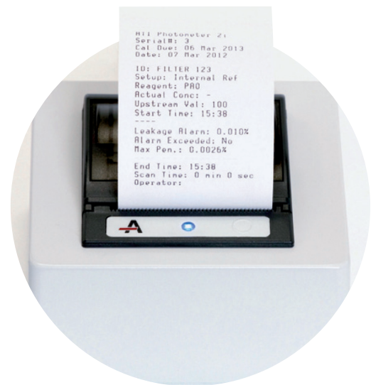
Optional Printer & Sample Report

The iProbe with a 12 ft cable acts as an extension of the base instrument through a nearly identical user interface. All status and selection icons from the base unit are represented on the iProbe. With the press of a button, the sampling location can be remotely selected and switched by way of an electronically controlled valving system.