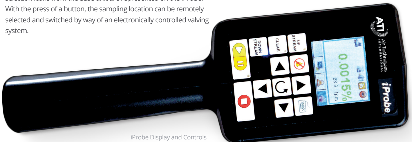
iProbe Display and Controls